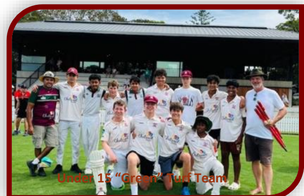
Under 15 "Green" Turf Team