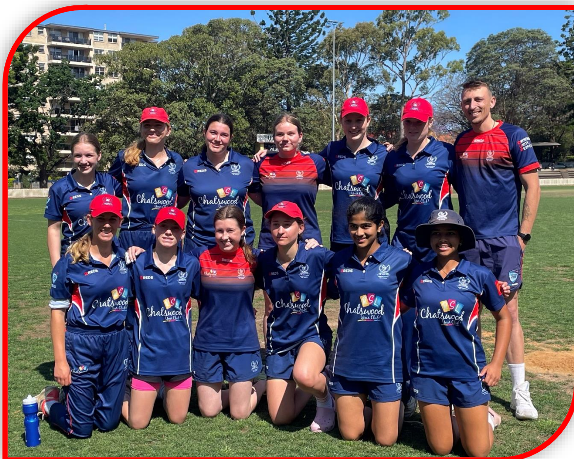
Gordon's Brewer Shield team