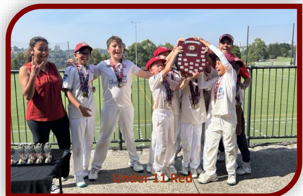
Under 11 Red