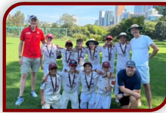
Under 12 1 Silver team

This season, we saw a slight decrease in player numbers (200 across our 21 teams) registering for the juniors U9s - U17s. Gordon fielded teams in every age group of the North Shore Junior Cricket Association competitions. All of the teams provide players with an equal opportunity to both bat and bowl. Our U11's had the opportunity to play some longer form games (30 overs on Sunday) to help prepare for rep cricket but also simply to spend more time honing their skills. Gordon put forward 2 teams for this short season. Well done. A number of players took up the opportunity to play in multiple teams which is a tribute to their passion for the game.