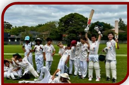
Under 11 "Blue and Orange" team

winning medals on grand final day in lower Cup divisions. The boys were appreciative of the medals they received and to finish the season on a high. Congratulations.