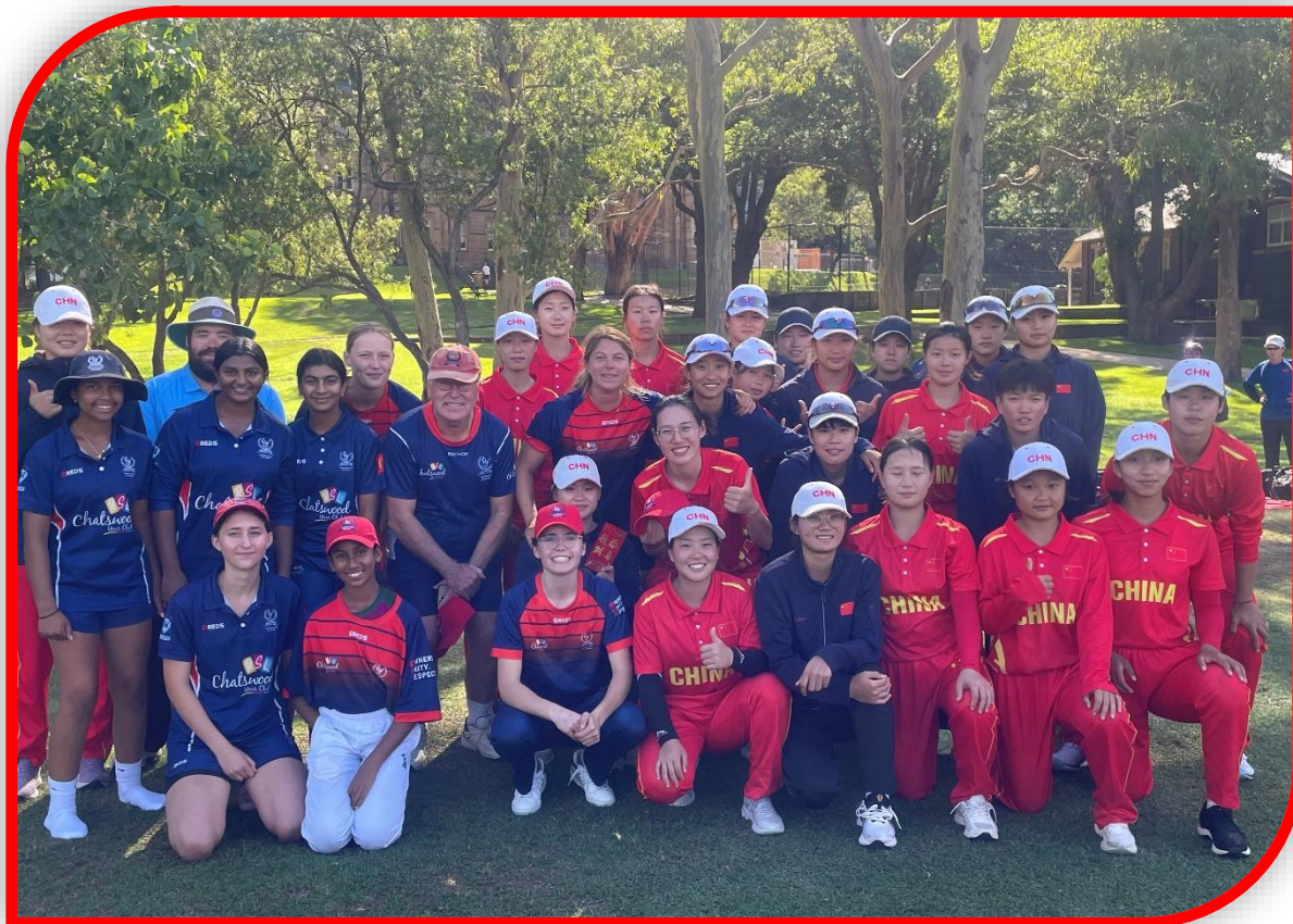
China National Women's Team