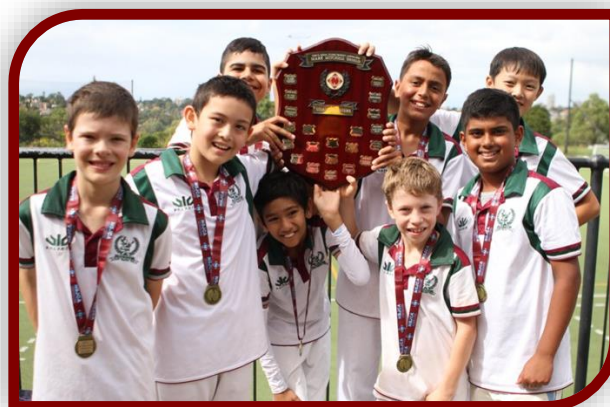
Under 11 Red