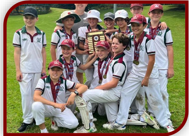
Under 13 T20 Green

Gordon Juniors continued to run our Blaster Program out of Chatswood High School on Saturday mornings from 8:00 - 9:30am. We returned to healthy numbers with Junior Blasters (27 participants) and Blasters competition (27 participants). It was great to see some many young children enjoying cricket, skills and activities. We thank all the parents, carers and volunteers who made the concerted effort to get along early on Saturday morning to make this such an enjoyable experience for all the children.