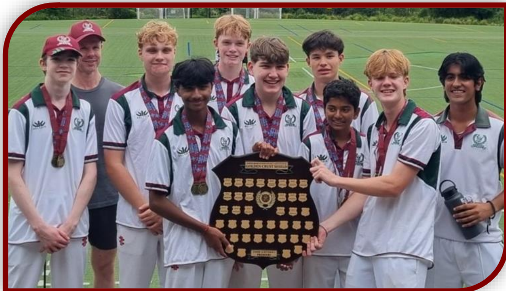
Under 15 T20 Green