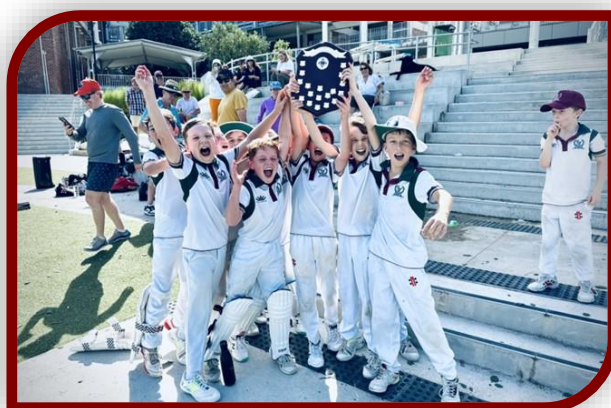
Under 11/12 Div 3 Green